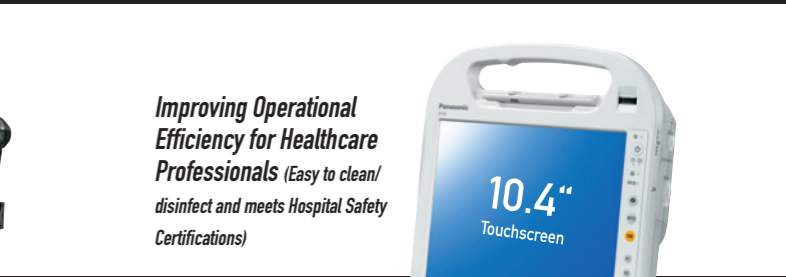
Robustness and Performance to the Max